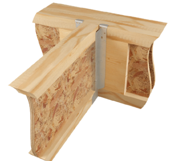
Typical THFI installation