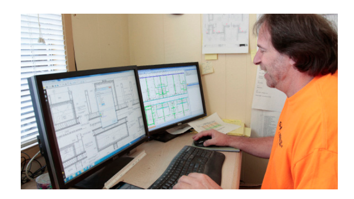
In 2012, Timber Technologies fabricated and framed 500,000 square feet of space, and in 2013 it jumped to 750,000 just in wall panels alone. The goal for 2014: 1,000,000 square feet \dots all with just one designer.

"Keep in mind that we have designed the wall panels, the floor trusses, and the roof trusses as an integrated, optimized structure," Martin added. "It's not like Ken and I are working on two parallel designs that we are trying to figure out onsite. It's the same SAPPHIRE model. It's all been digitally pre-built and fabricated in collaboration. Errors and structural conflicts have been worked out."