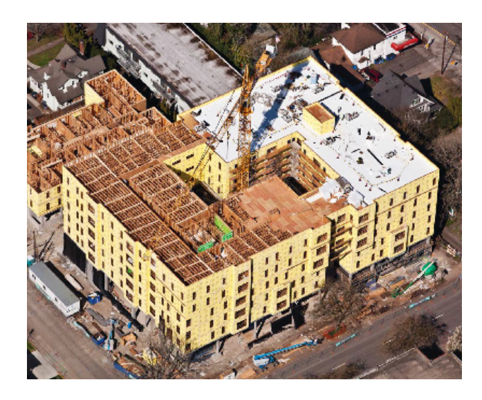
"We've been watching a 250,000 to 300,000 square foot stick-frame job in nearby Portland," said Ken Pappadis, "In the time it's taken that crew to frame it, we've done six wall panel buildings, including a 150,000 and a 120,000 square foot project. And they're even not done with their stick framing yet!"

"Then, in the final plans, whether we print them or send them out over SAPPHIRE Viewer to the field, I can also color code annotations, so the subs can see just the instructions meant for them. And plus, SAPPHIRE lets us both work in 3D," Pappadis said.