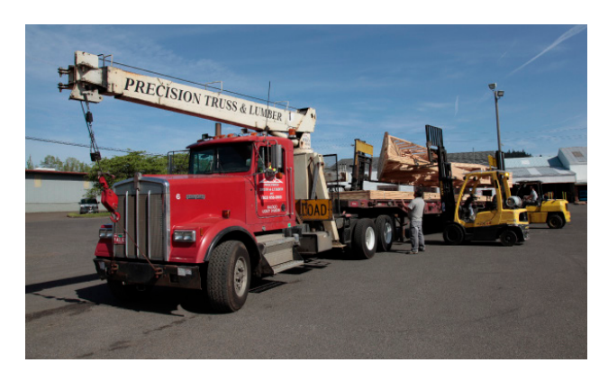
In 2013, Precision Truss & Lumber will sell around $9 million in trusses, and another $15 million in lumber. They are just about to go back to two shifts on the truss fabrication, with a staff of 50 full-time workers. They run five crane trucks and seven lumber trucks to haul the volume.

"We can obtain that level of detail in SAPPHIRE," Martin said, "because either Ken or I can click on the wall and extract any information about it. Wall height, length, bearing points, header locations, header thicknesses, plate material, you name it. We don't have to go searching for it. It's all in the SAPPHIRE 3D BIM model."