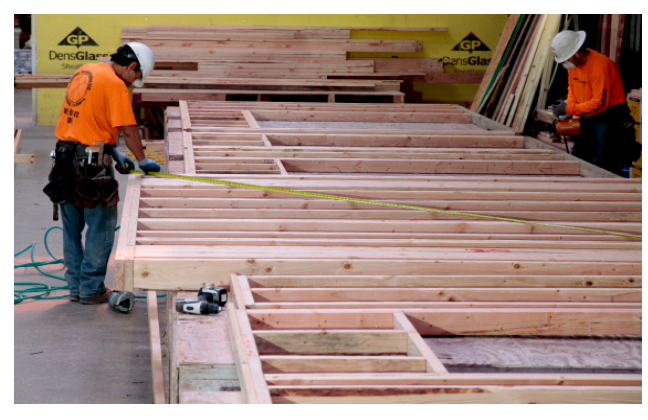
The framing team at Timber Technologies can click on the wall and extract any information about it. Wall height, length, bearing points, header locations, header thicknesses, plate material, you name it. It's all in the

To manage that volume, Precision Truss & Lumber runs five crane trucks and seven lumber trucks, which haul materials to the same Northwest regions where Timber Technologies ships and installs its walls.